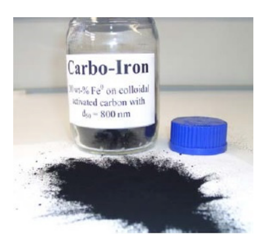
Figure 4. Carbo-Iron® is an air-stable powder.

Carbo-Iron<sup>®</sup> is an air-stable in situ reagent developed at The Helmholtz Centre for Environmental Research - UFZ (Figure 4) targeting halogenated organic contaminants or heavy metals in groundwater. Carbo-Iron<sup>®</sup> consists of activated carbon colloids which are doped inside with nanoiron structures (mean cluster size around 50 nm, ZVI content 20-30 wt%). Both materials contribute to the particle properties. The porous composite has an effective density in water of approximately 1.7 g cm<sup>-3</sup> which in combination with its optimised size and surface properties ensures an effective subsurface transport of the reagent particles. Carbo-Iron<sup>®</sup> has been field tested and is commercially available from ScIDre GmbH.