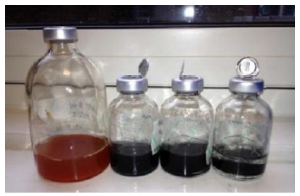
Figure 5. Ferrihydrite (left), large bottle is control without bacteria and the three small bottles are replicates containing Geobacter sulfurreducens , which is reducing ferrihydrite to form bionanomagnetite.

Bionanomagnetites are a developing nanotechnology which would be expected to be market ready in 1 to 5 years.