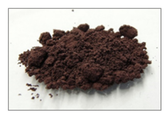
Figure 6. BaFeO<sub>4</sub> sample.

Ferrate(VI) salts are very strong oxidants and could hence be a promising agent for water and wastewater treatment processes. Barium ferrates ( BaFeO_4 ) offers slow-release properties and could hence be utilised to create a depot effect in the aquifer. Ferrate(VI) is synthesised electrochemically; barium ferrate is obtained by subsequent precipitation (Figure 6). In order to investigate the reactivity of barium ferrate towards BTEX contaminants batch tests have been conducted using toluene as a model contaminant. This is a bench-scale research concept being tested by VEGAS, University of Stuttgart, which has not yet seen field deployment.